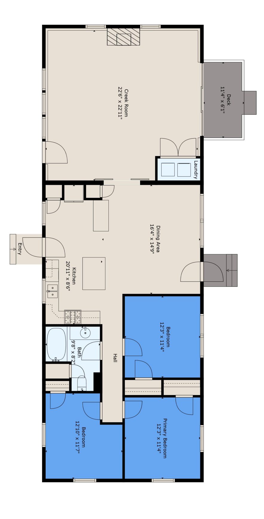
TOTAL: 1594 sq. ft FLOOR 1: 1594 sq. ft EXCLUDED AREAS: STEPS: 25 sq. ft, DECK: 73 sq. ft